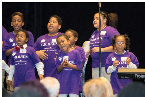
C.O.G.s singing "Every Praise"